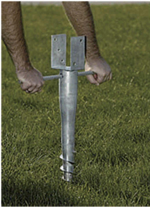
Step1 Twist into the ground.