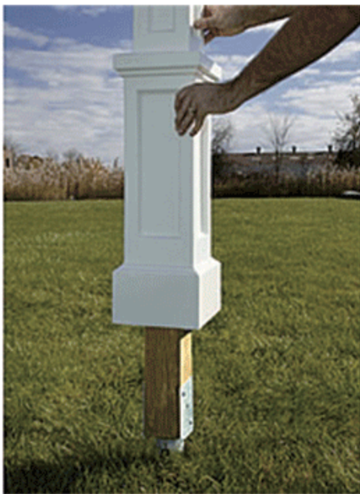
Step3 Slide decorative post over 4x4.