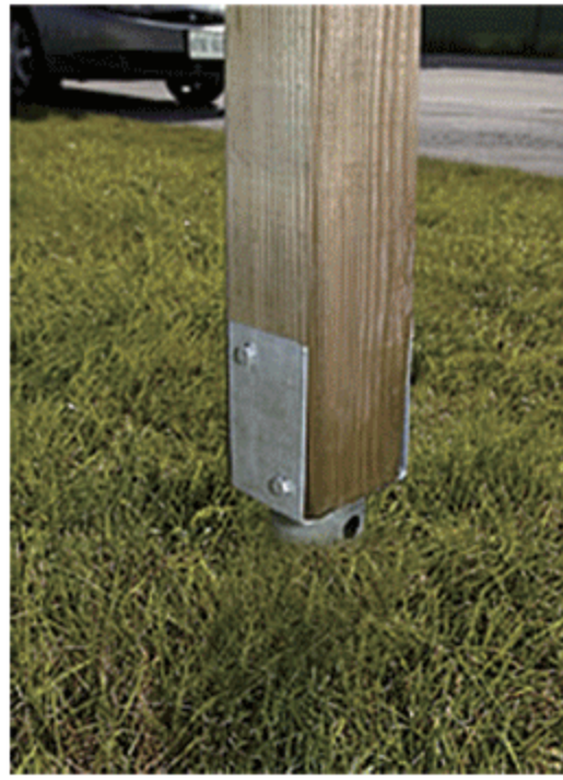
Step2 Secure 4x4 wood post with lag bolts.